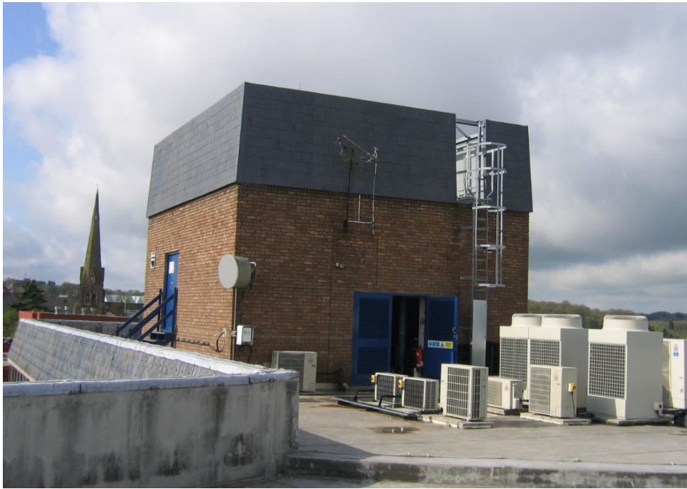
Telecoms equipment hidden behind GRP screen on upper roof

Design, co-ordination and planning submission of a RF transparent GRP concealment - London